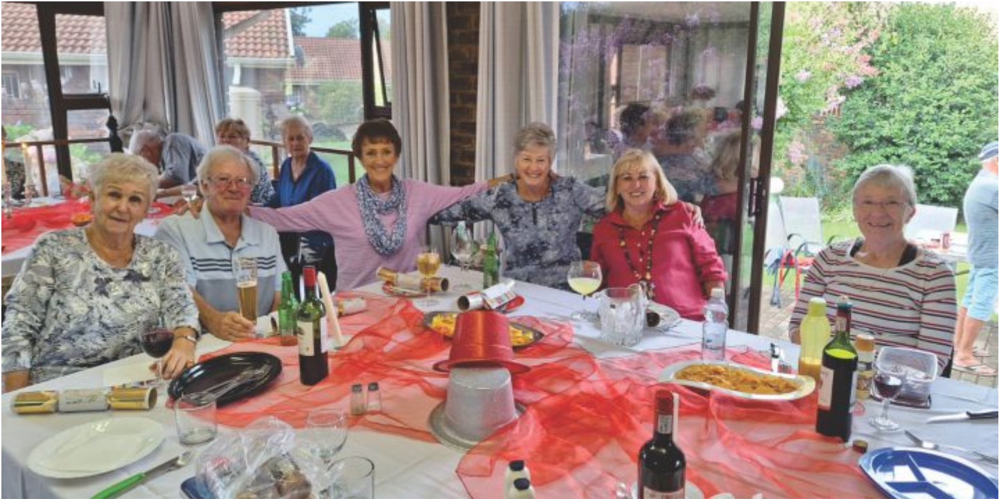
RYNPARK 6 - NEW YEAR'S EVE