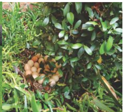
Visitors with eggs in my garden. RP5 Unit 98